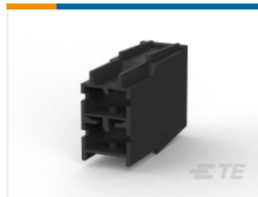
TE Part # 100100-1 2 POS POSITIVE LOCK (PL) HOUSING BLACK