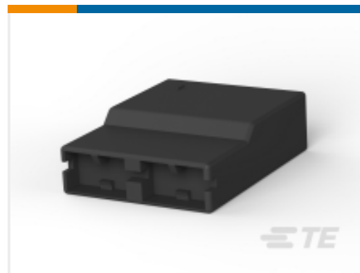
TE Part # 926716-1 PL 2P HOUSING PA 6.6 ZYTEL 101 BLACK